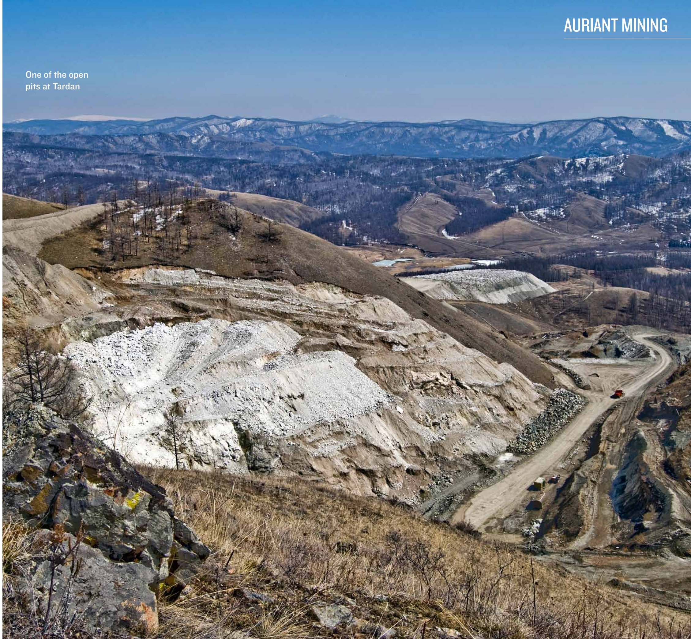
One of the open pits at Tardan