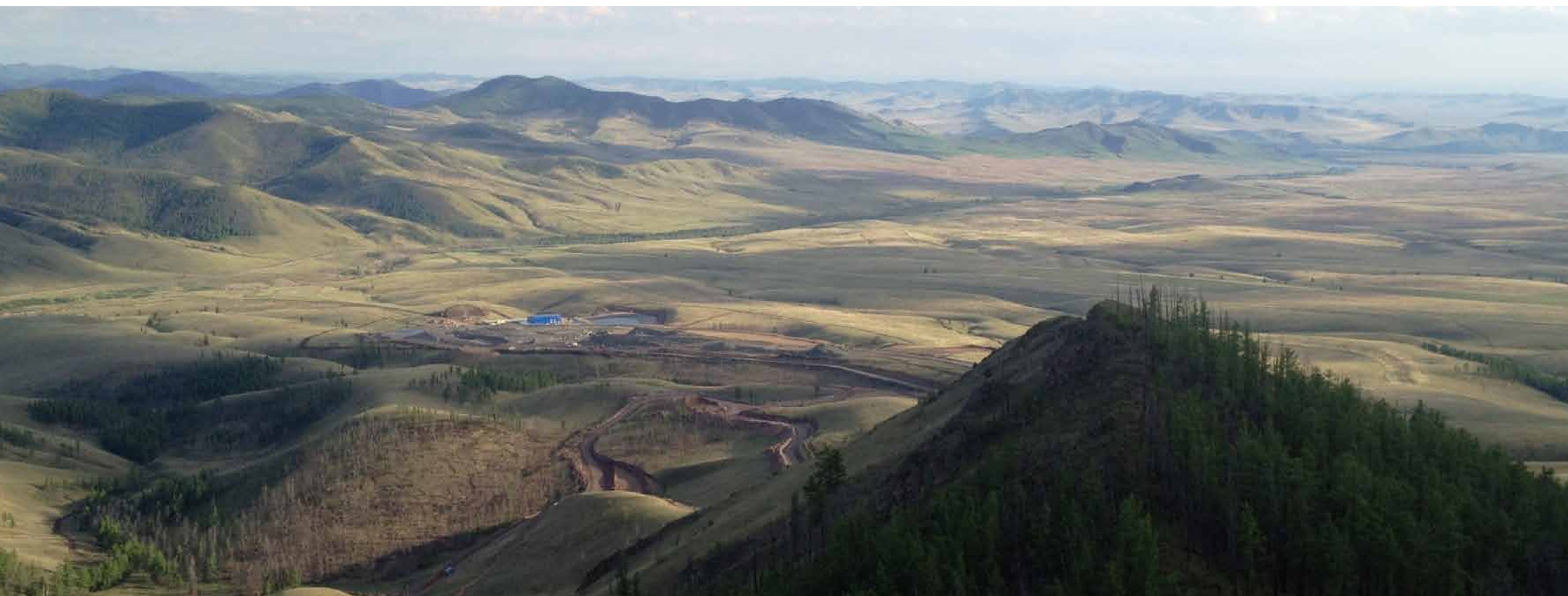
Tardan camp and mill

“While there are other junior exploration companies in Russia, we are one of the only