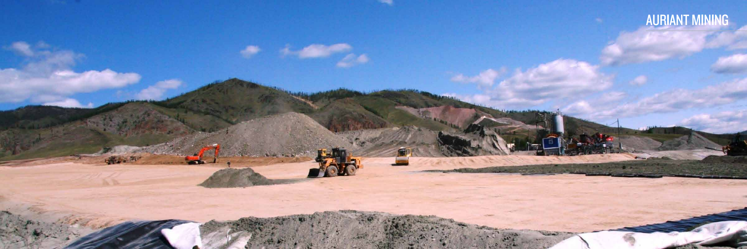
Start of a new heap leach at Tardan